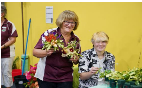
Two happy 'Posie' makers at our show