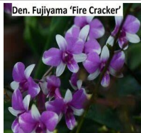
March Feature Plant –