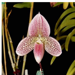
Paph. Doris Behrendorff