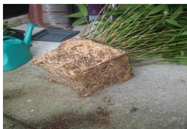
Sobralia Mirabilis before division