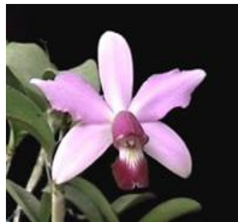
June Feature Plant- 'Cattleya Alliance'