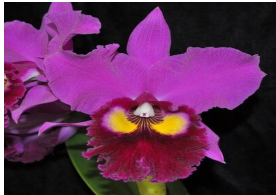
Rlc. Anna Seiki 'Volcano Queen'