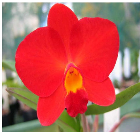
C. Bright Angel 'Super Nova' x C. Jillian Lee