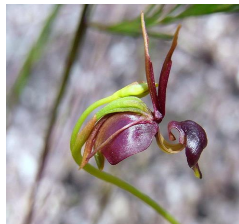
August Feature Plant- Australian Native Orchid. Caleana major