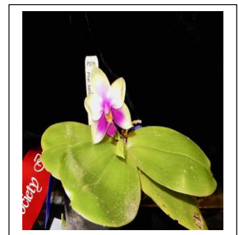
Phal. bellina 'Ivy x Phal bellina 'Ivy' #14