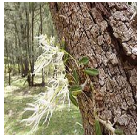
April Feature Plant- 'Species Orchids'