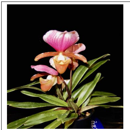
Feature Plant Paph. charlesworthii