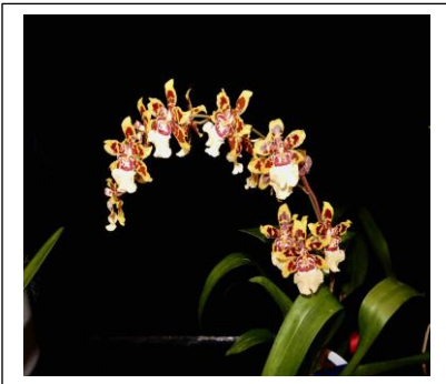
Ons. Wildcat #13